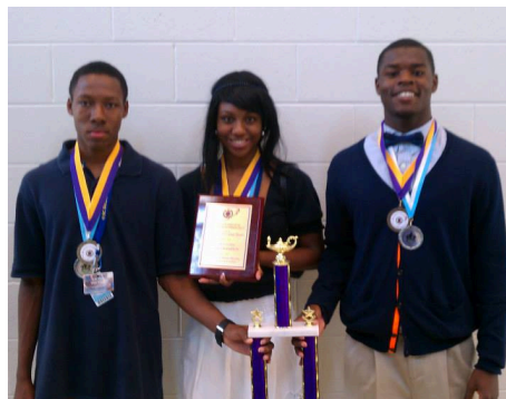
Team members of the 2013 Champion Black History Bowl. 2 nd place honors on district level